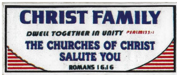
Bumper sticker recently picked up in Nigeria.

The ACSF Bulletin is published quarterly by African Christian Schools Foundation , a 501 c(3) non-profit ministry which began in 1959 and is overseen by faithful members of the Churches of Christ throughout the United States of America.