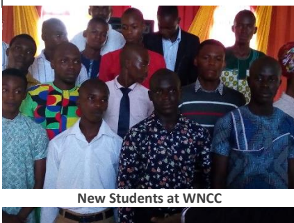
New Students at WNCC