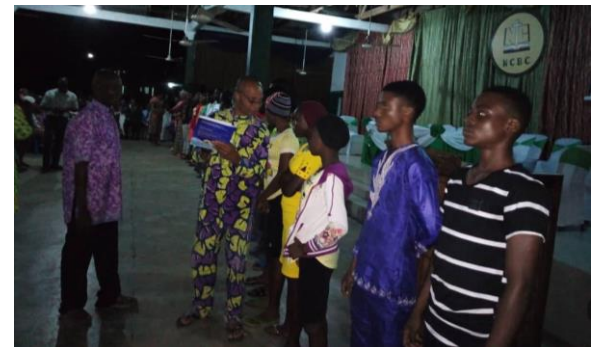
Responses for Baptism

This year is seeing a BIG jump in new student enrollment at both of our schools in Nigeria. WNCC has brought in 25 new students . NCBC has brought in 33 new students . All of those students started their studies in August of this year. This means a total of 209 students studying God’s Word to the Glory of God!