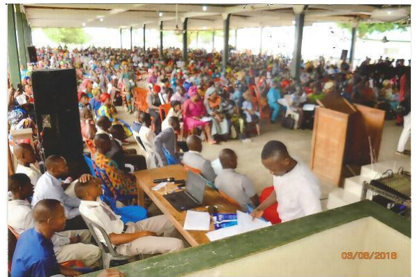
The N.C.B.C Lectureship Crowd August 3rd 2018